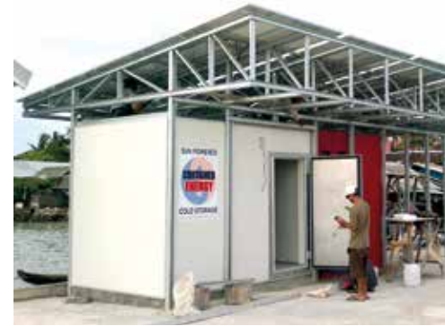
⚡ Solar powered cold storage system