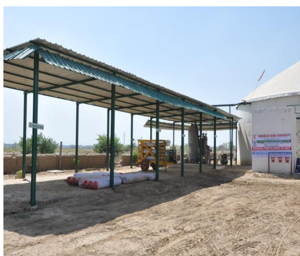
Biogas bottling project at Singla Bio-Energy, Vill.–Siaghawali, Teh.-Sadulsehar, Dist.–Sri Ganganagar (Rajasthan)

This biogas bottling project will be able to replace fuel & manure worth of about Rs. 35 lakh annually. The full cost of the project would be recovered within four to six years. The separation and bottling of CO 2 and extraction of Humic acid from slurry would further improve viability of biogas bottling plants. The biogas bottling project provide three-in-one solution of gaseous fuel generation, bio /organic manure production and wet biomass waste disposal/management.