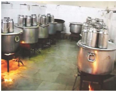
Used in Mid-day meal scheme