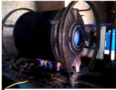
Used in Manufacturing of plastic tanks