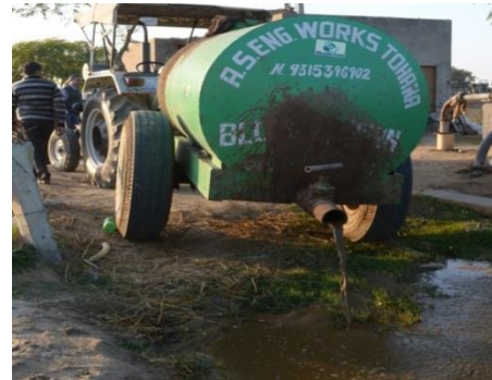
Dry or Liquid Slurry used in Agricultural field