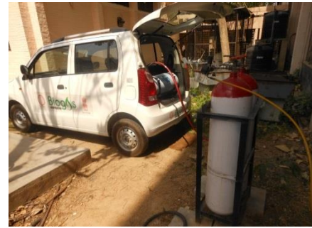
Used as vehicular fuel

The slurry which comes out of the biogas plant is directly or after drying used as bio/organic manure for improving soil-fertility and reducing use of chemical fertilizers. It is also non-pollutant because it is free from weed-seeds, foul smell and pathogens. The slurry is rich in main nutrients such as Nitrogen, Potassium and Sodium (NPK) alongwith micronutrients - Iron & Zinc etc. As such there is no pollution from biogas plant. The slurry/manure of biogas plant is being sold to the farmers and used in liquid/solid form by them in agricultural crops. The field trials have indicated the excellent growth in agro-production and substantial improvements in the quality.